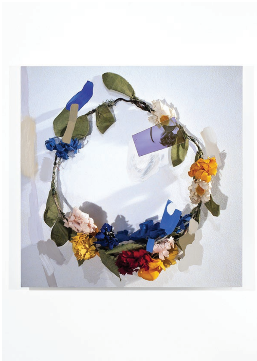
Alexandra Gorczynski, Loops , 2014

Mousse Magazine and Publishing Via De Amicis 53, 20123 Milano, Italy T: +39 02 8356631 F: +39 02 49531400 E: info@moussemagazine.it