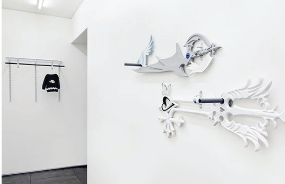
Jasper Spicero, Intriors II , 2014