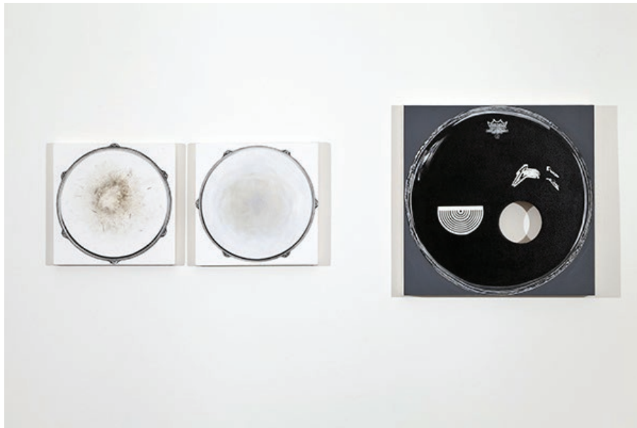
Conor Backman, Untitled from series "Canvas is struck with sticks", 2014 and Metasymbol, Metallica symbol, cymbal symbol , 2012