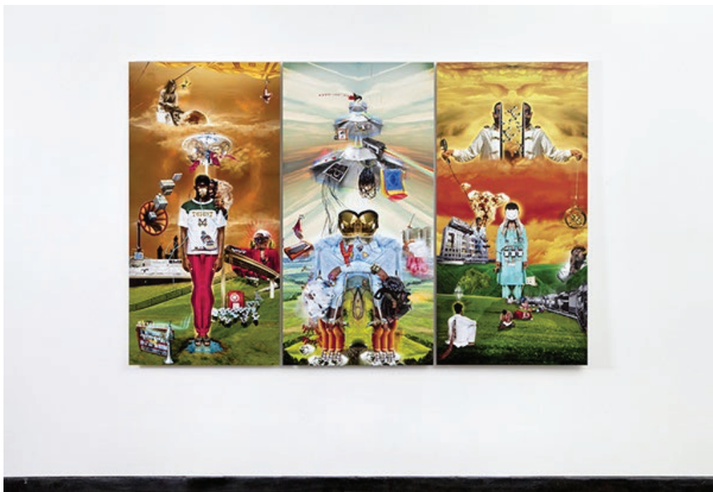
Mehreen Murtaza, Triptych , 2009