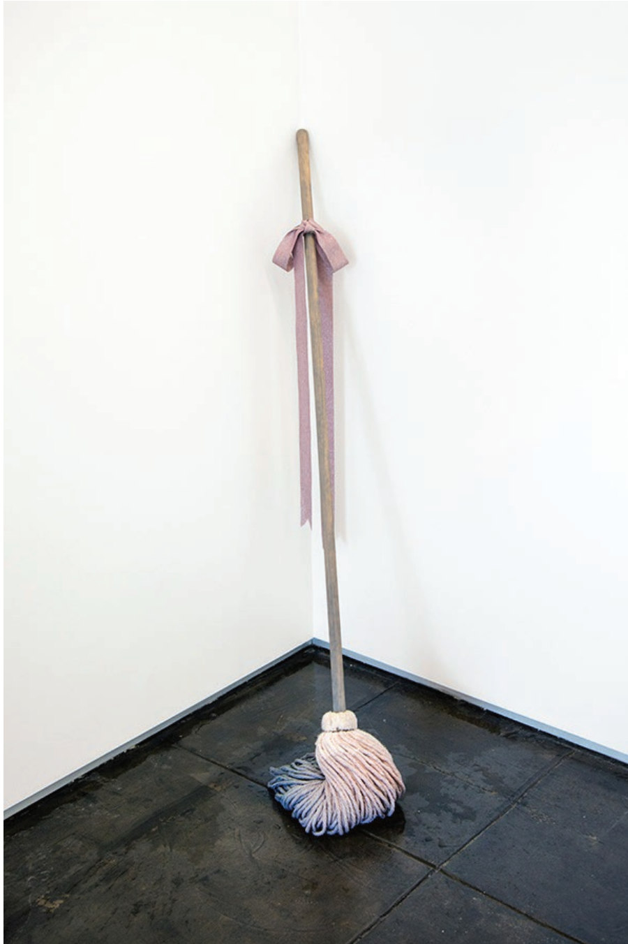
Bunny Rogers, Self-portrait (mourning mop) , 2013