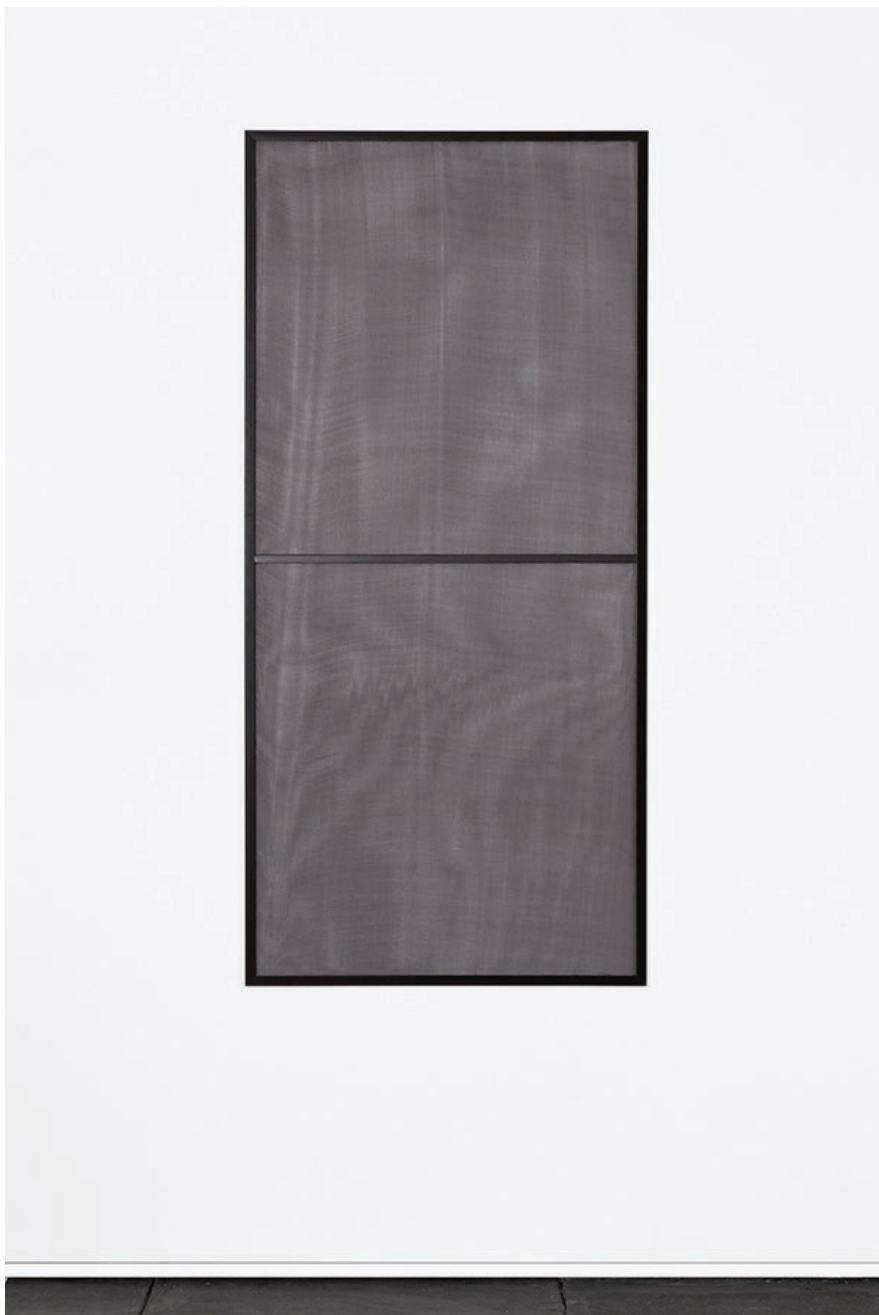
Artie Vierkant, Air filter and method of constructing same 18 , 2013